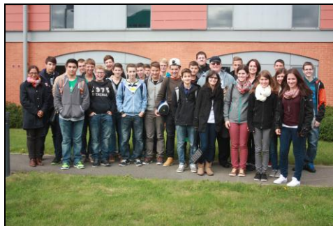
German School visiting Borehamwood 18 th September 2013