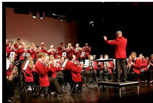
Rammersweier Musikverein in The Ark Theatre as part of the Civic Festival 2014