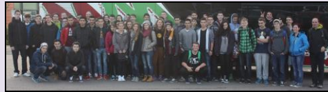
Ernst Kästner Real Schule