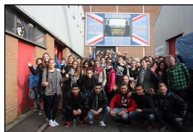
Offenburg School Visit Elstree Studios

BETTA works hard to ensure individuals and groups have the opportunity to develop their cultural knowledge. We strive to produce opportunities for the community both here and in our twin towns. We will continue to make sure BETTA goes from strength to strength. All members of the committee have a wide and varied range of skills and abilities which contribute to the running of the association.